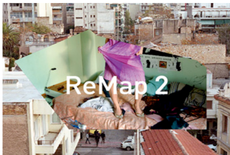
ReMap2 - Athens, Greece

senseofplace LAB organizes community-based place-specific public art contests.